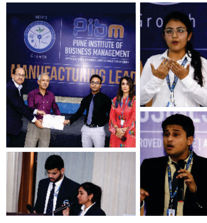
2019 | www.pibm.in

The Business Communication & Soft Skills department of PIBM Pune conducted the public speaking competition 'The Great Orator Of PIBM' for Batch 2019-21.